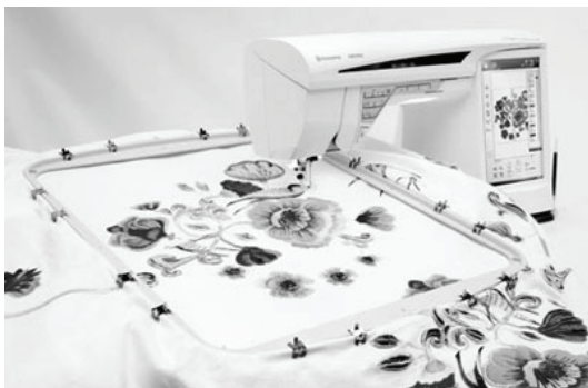
Husqvarna Viking Designer Diamond